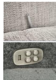
manual or powered operation